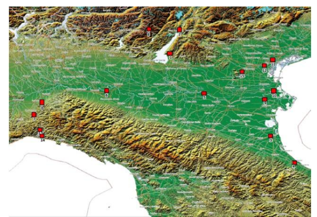
Figure 4: AOI of the Po Plain in Italy with 15 test sites

Additionally, the slope-dependent and area-wide horizontal accuracy was tested over 15 test sites located in the northern part of Italy and covered by a DSM processed from approximately 420 stereo pairs (Po Plain, 90,000 km<sup>2</sup> (see Figure 4 from [4]). To avoid potential problems with georeferencing in very flat and untextured areas (Po Plain), the more textured surrounding areas (Alps, Apennines) were used to achieve a good horizontal accuracy.