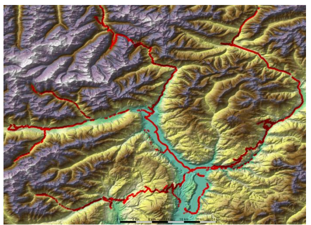
Figure 3: Euro-Maps 3D DSM of Bozen, Italy, with the corresponding GPS transects

22 test sites from within the Euromap IRS-P5 acquisition footprint and well distributed across Europe, Turkey and North Africa were chosen for the accuracy tests. The test sites were identified according to various criteria, such as good coverage by GPS transects, a range of landscapes, e.g. urban areas, forested areas, agricultural areas, and dry areas, and various types of relief (flat, hilly, mountainous) [9].